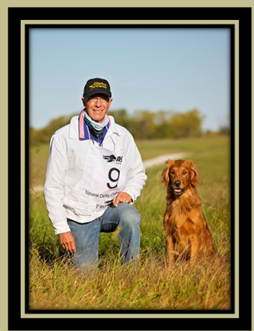
Topbrass Flying Redd Hawk Of Mtn Sky QA2