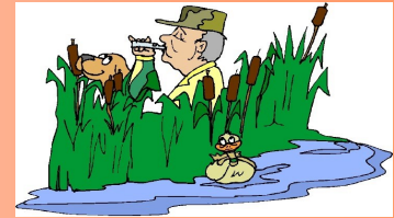
Rich Carpenter & Popi